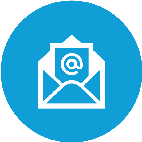
POSSIBILITIES: ANALYZING EMAIL TRAFFIC